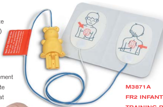
M3871A FR2 INFANT/CHILD TRAINING PADS