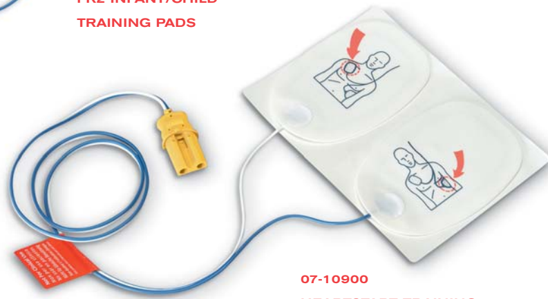
07-10900 HEARTSTART TRAINING PADS